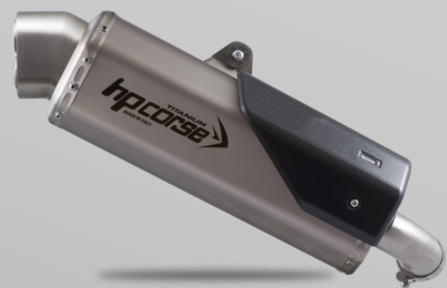
4-TRACK R TITANIUM APPROVED EURO 4