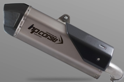
SPS CARBON TITANIUM APPROVED EURO 4