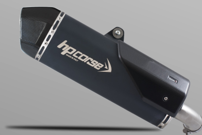
SPS CARBON CERAMIC BLACK APPROVED EURO 4