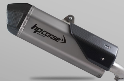
SPS CARBON SATIN APPROVED EURO 4