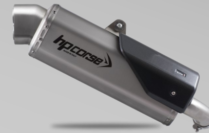
4-TRACK R SATIN APPROVED EURO 4