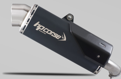
4-TRACK R CERAMIC BLACK APPROVED EURO 4