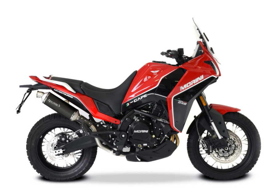
SP-1 SHORT BLACK TITANIUM SILENCER + DECATALYST Code MOXCSP1300C-AB + Code MOXCS-D