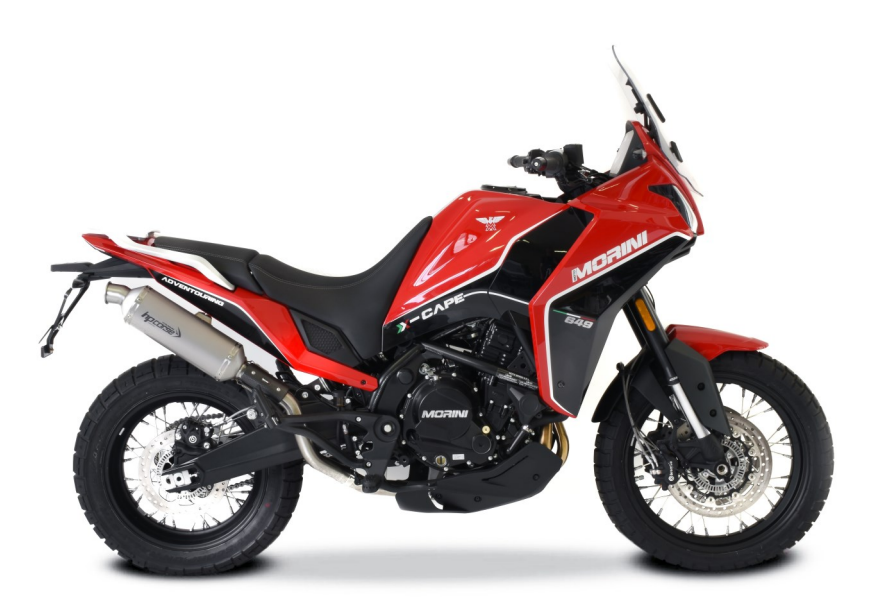
SP-1 SHORT TITANIUM SILENCER + DECATALYST Code MOXCSP1300T-AB + Code MOXCS-D