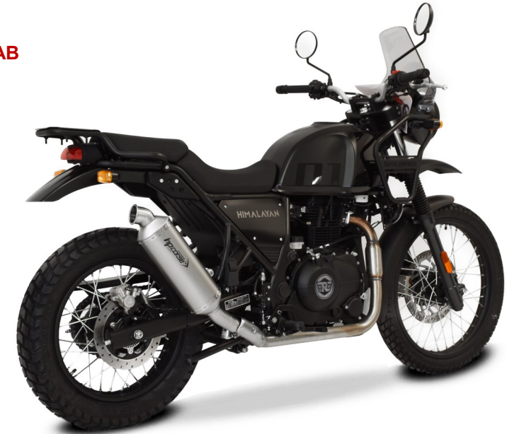
Titanium Code: REHISP1300LT-AB

2.200 gr. SP-1 SHORT Stainless + RALLY LINK-PIPE