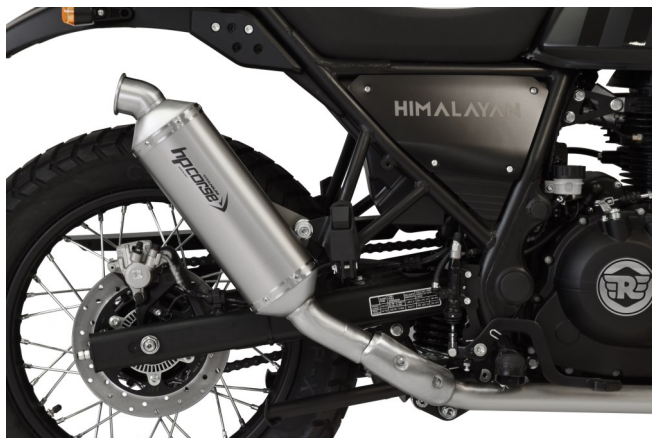
Titanium Code: REHISP1300LT-AB