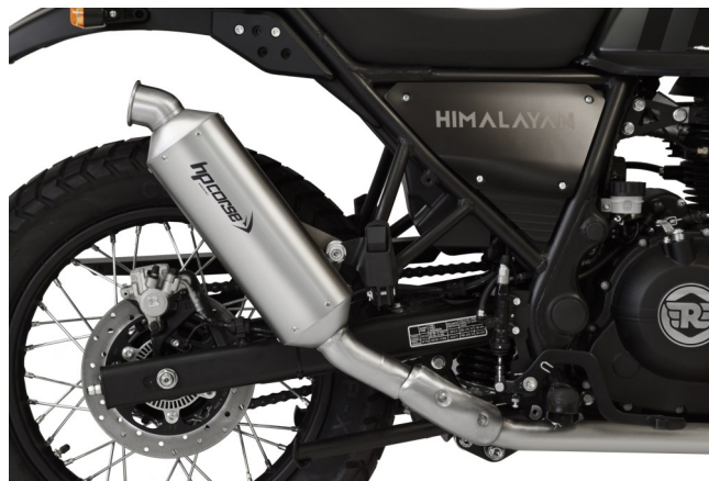
Satinated Steel Code: REHISP1300LS-AB