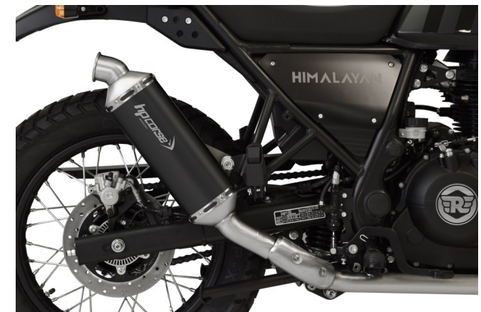
Mat Black Steel Code: REHISP1300LC-AB