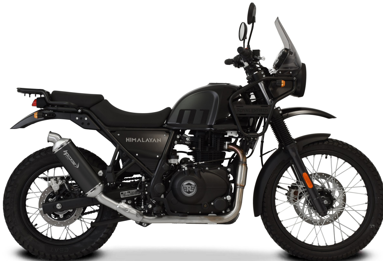
Mat Black Steel Code: REHISP1300LC-AB

Less is more, the art of simplicity as ultimate expression of sophistication. A minimalistic yet modern approach for a new breed of exhausts with a no-frills look ready to unleash its true essence. Because the very essence of things lays in simplicity. Inspired by the great African rallies and their myth, the new SP-1 has been masterminded in the heart of the Motor Valley and reinterprets the past in order to shape the future. An ultra lightweight oval-shaped exhaust featuring a minimal round shaped and non welded nozzle which perfectly fits the latest off-road motorcycles. Sturdy in shape and soul, SP-1 comes with a full titanium or stainless body, slip on system and removable db killer. The exhaust features TIG handwelded mounting brackets, a machined by solid inlet and HP Corse laser engraved logo. Engineered to be the strongest, SP-1 has been extensively tested at the test bench and on the most demanding tracks. Available in one lengths, 300 mm, according to desired mounting position.