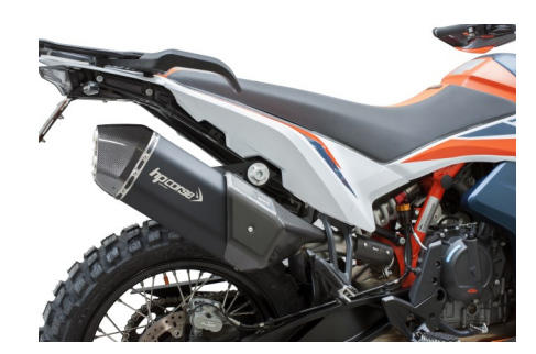
SPS CARBON SHORT BLACK STEEL