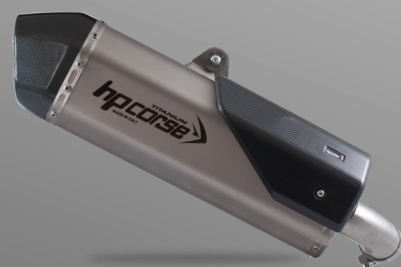
SPS CARBON TITANIUM APPROVED EURO 4