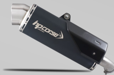
4-TRACK R CERAMIC BLACK APPROVED EURO 4