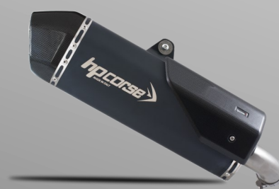
SPS CARBON CERAMIC BLACK APPROVED EURO 4