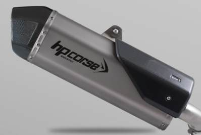
SPS CARBON SATIN APPROVED EURO 4