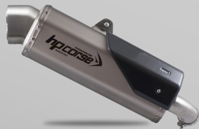
4-TRACK R TITANIUM APPROVED EURO 4